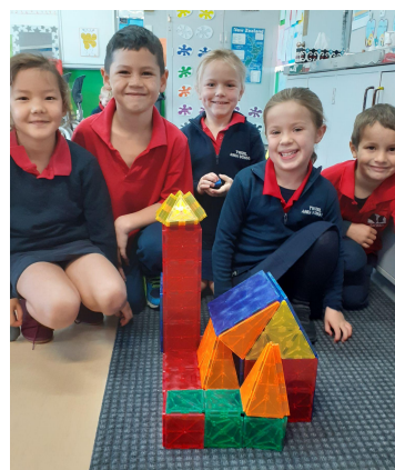
Tamariki construction using magnetic geometrical shapes